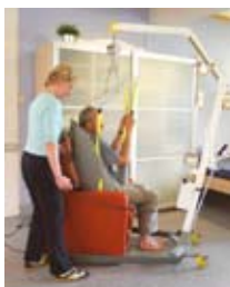
Body support systems

The handling of people in a hospital environment makes this difficult to implement. It is also imperative to take patient dignity into account.