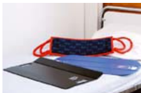
bed-bed transfer board

These boards, which are covered in slippery fabric or which are made from slippery material, enable patients to be transferred from one bed to another, from a bed to a chair or to a wheelchair by sliding rather than lifting.