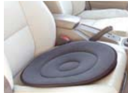
a disc which makes it easier to exit a vehicle