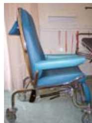
height-adjustable arm rests