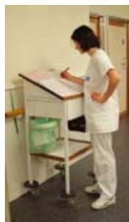
Trolley adapted to writing height