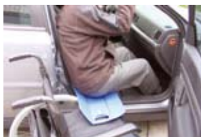
vehicle-wheelchair transfer board