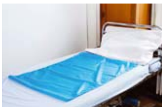
sheets which can be used to raise patients