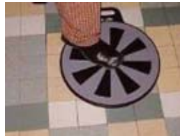
rotating floor disc