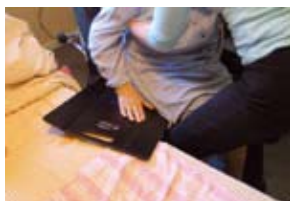
chair-bed or chair-chair transfer board