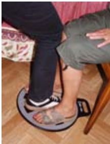
turning disc to help patient rotation when seated

There are similar discs which make it easier to enter or exit a vehicle.