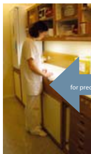
Adapt the height of the worktop according to the activity

In order to avoid postures which might cause back pain, such as bending over forwards or bending/rotating of the torso, it is necessary to change the height of the worktop in accordance with the type of work carried out.